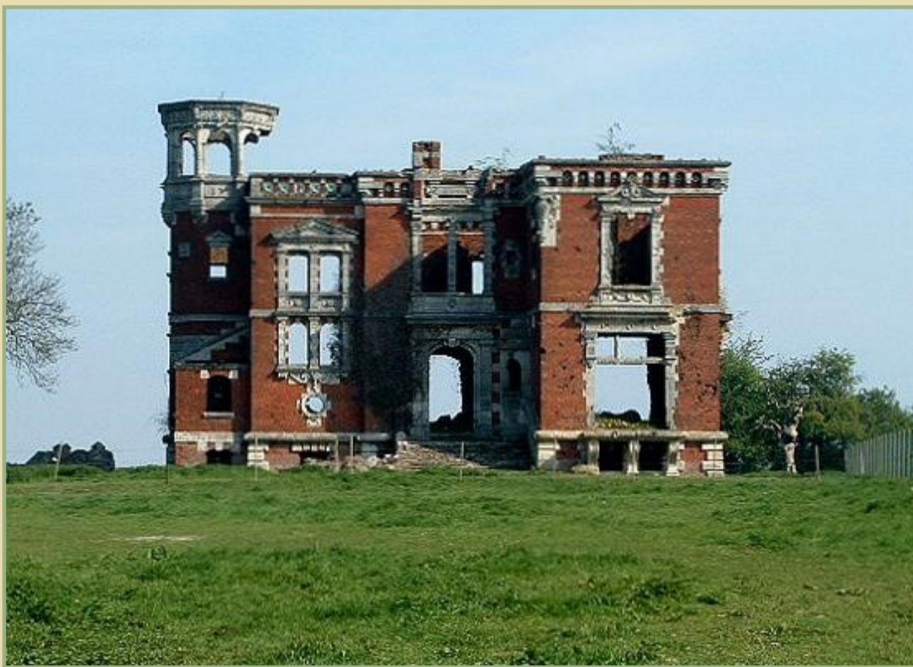
Red Chateau, Villers Bretonneux, France